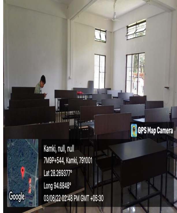
(Classroom no. 04,07 & 08)