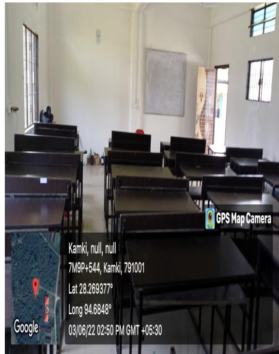
(Classroom no. 12,13 & 14)