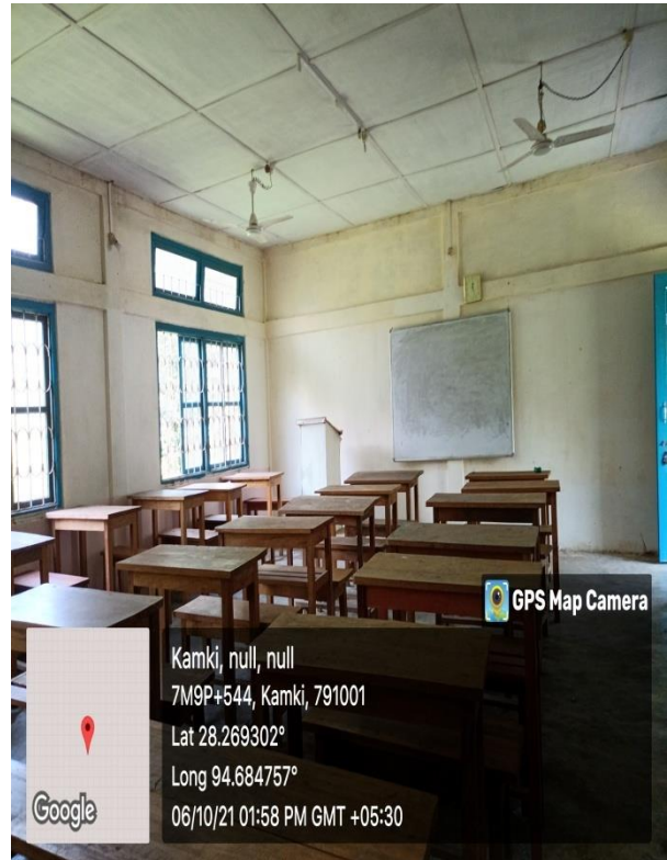
(Classroom no.01, 09 & 06)