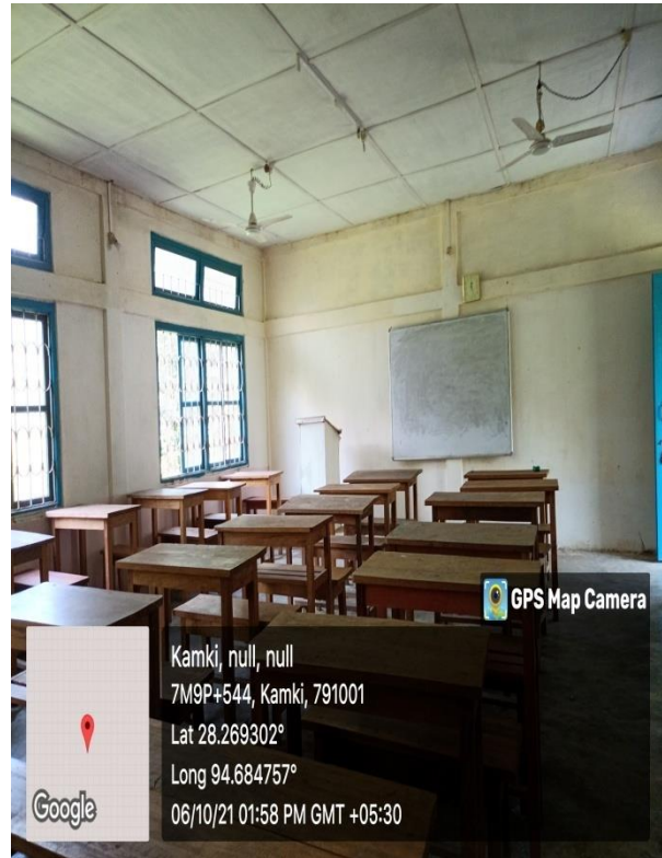
(Classroom no.01, 09 & 06)