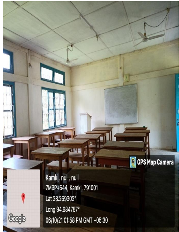
(Geography Lab Cum Classroom)