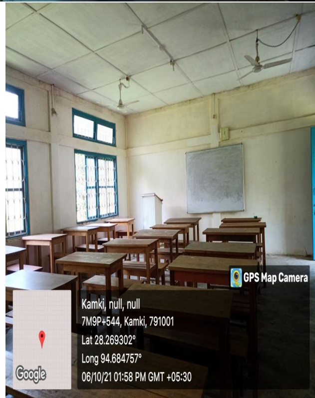
(Classroom no.15, 16 & 17)