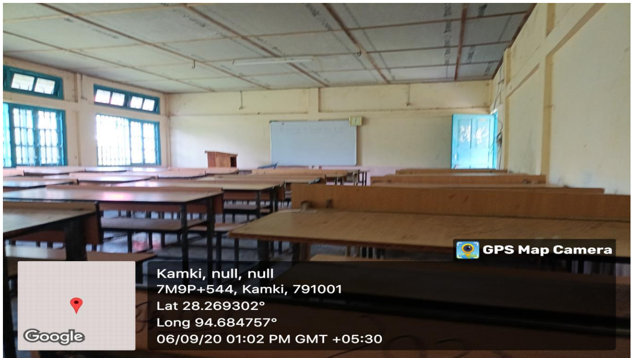
(Class Room- 04 and 08)